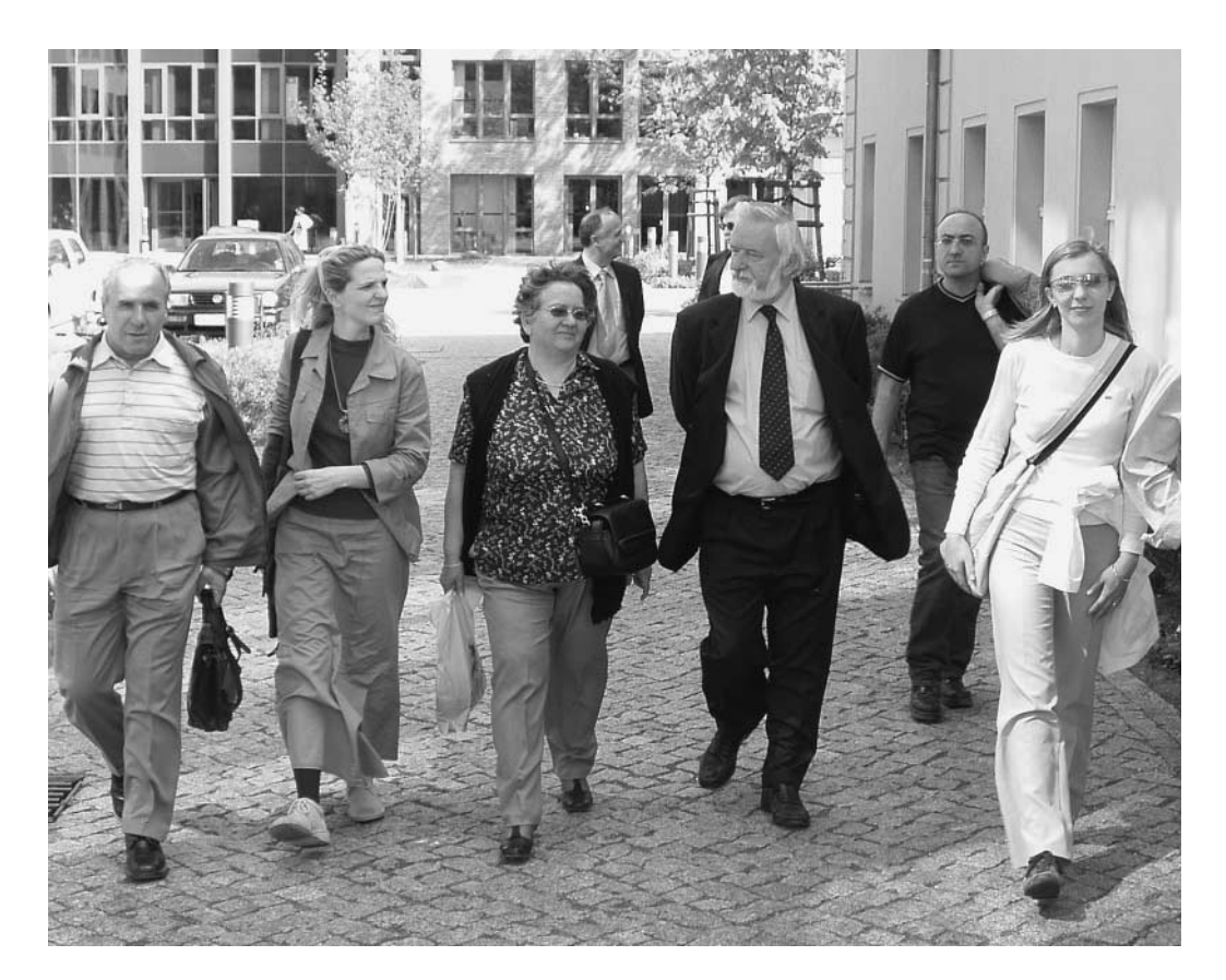
Visiting the German National Broadcasting Archives (DRA)

guided you as one of the initiators of the ISMN?