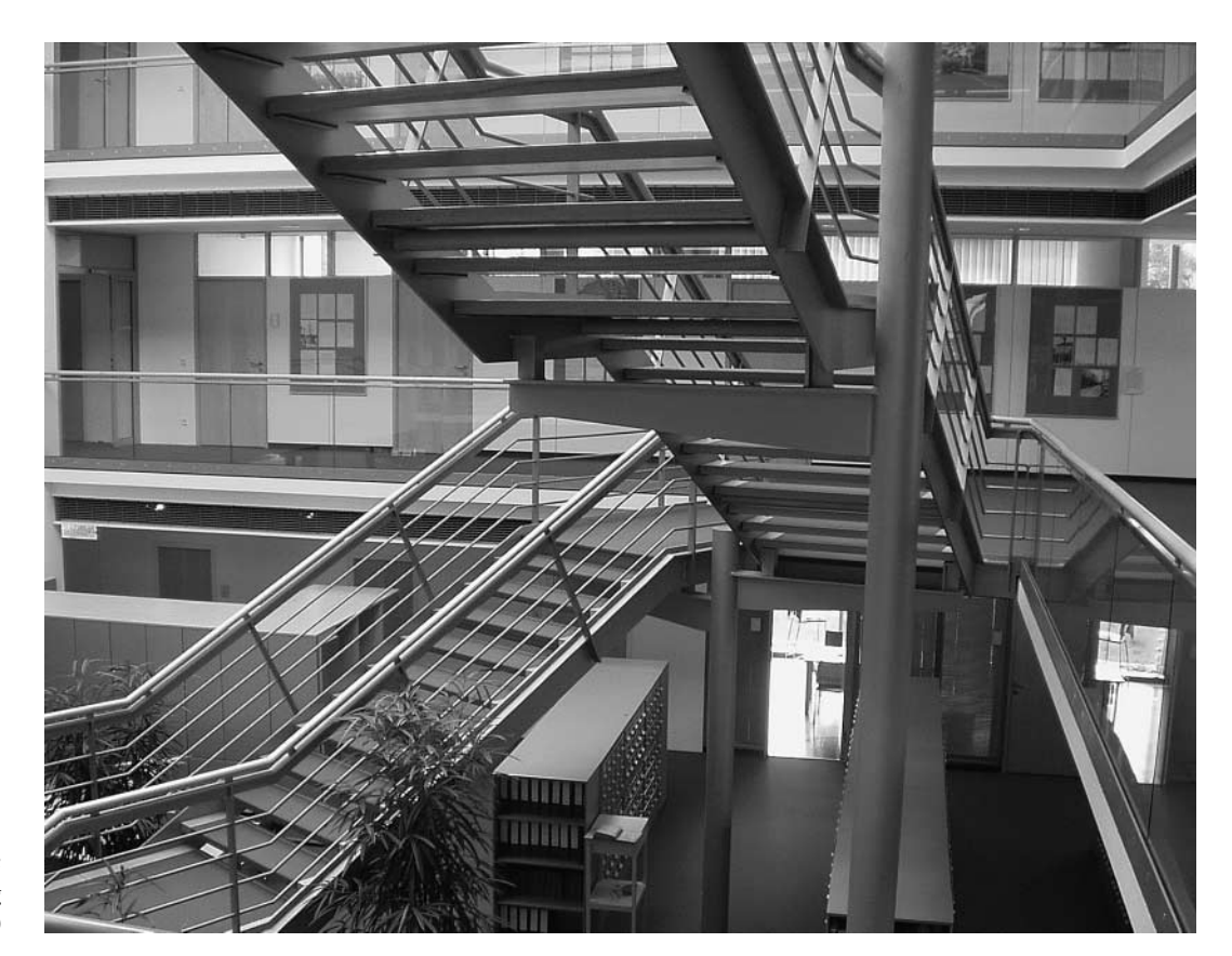
Inside the German National Broadcasting Archives (DRA)

the ISMN came up, there was a certain reluctance – to say the least – to invest in human resources to simply key all these fantastic new numbers in.