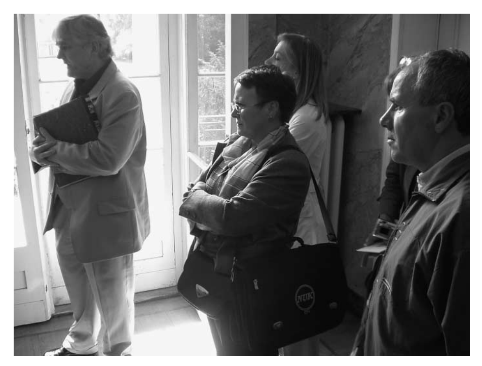
Visiting the Deutsche Musikarchiv (DMA) in Berlin

The successful extension of legal deposit to non-print media is dependent on regulations that haven't been drafted yet. But one hopes that requiring input from both the publishing and library profession means that there is a